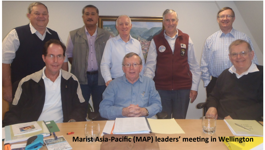
Marist Asia-Pacific (MAP) leaders’ meeting in Wellington